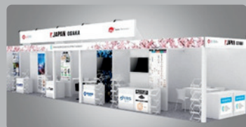
Osaka Business Development Agency (O.B.D.A)

Specialising in the manufacture and sale of any type of lubricants.